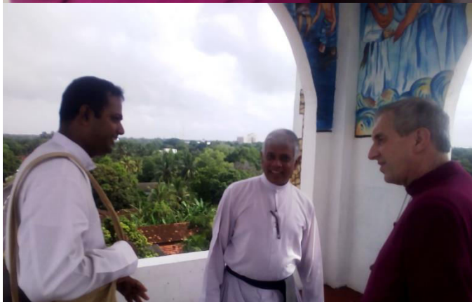
Inside the Viewing Gallery – a tranquil place with a picturesque scenery all around