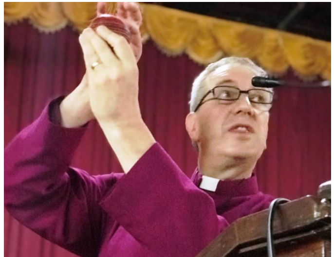
The insignificant globe in the large expanse of the universe