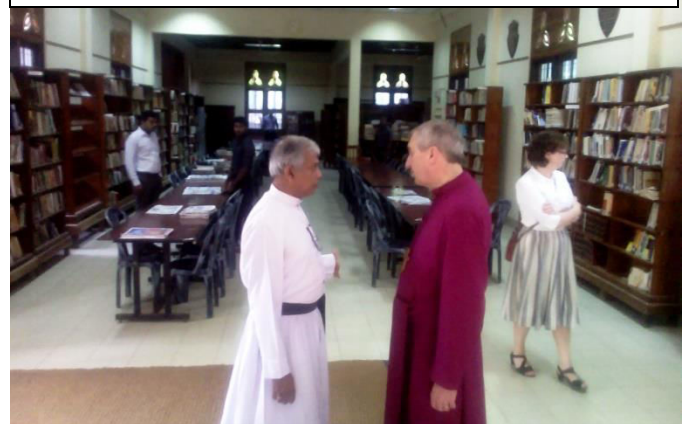
A quick look at the building where Mahatma Gandhi stood years ago