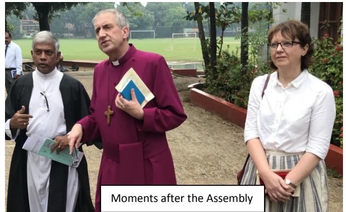
Moments after the Assembly

After the function, the entourage went on a tour of the College.