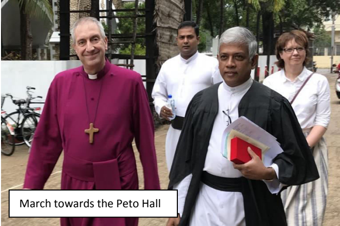
March towards the Peto Hall