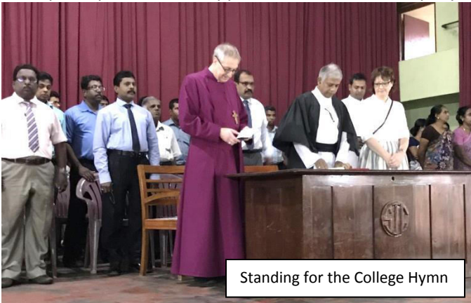
Standing for the College Hymn

A quick special assembly was convened where, after the College Hymn, Student's Prayer and Student's Oath, the Principal expressed his happiness to invite 'the Royalty.'