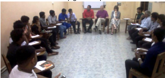
Meeting the Students of the Faculty of Christian Education & Sports Management

As an ice-breaker, everyone present, including the Principal introduced themselves. After the introduction, a few questions about the Bishop, the Church of England and the British Parliamentary System were asked. The Bishop gave eloquent answers.