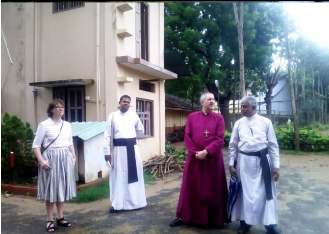
In the Primary School where the Bishop heard 'happy sounds.'