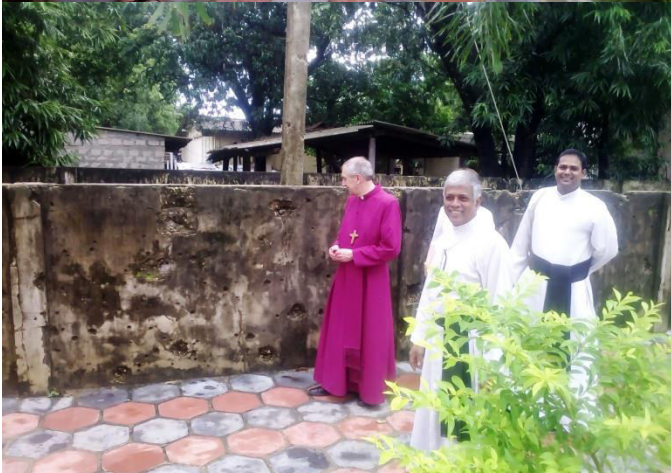
Bullet-ridden holes in the wall – grim reminders of the past...