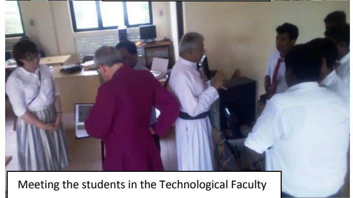
Meeting the students in the Technological Faculty