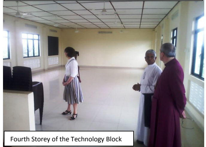
Fourth Storey of the Technology Block