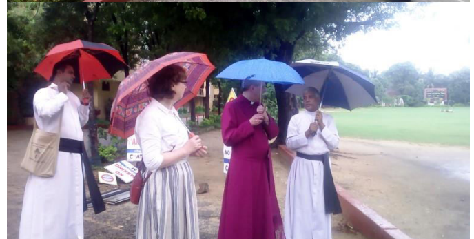
At the grounds where many a ground record had been broken