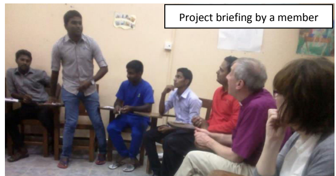
Project briefing by a member

Asked how the Faculty of Christian Education and Sports Management can ensure that people are not snared by drugs, pornography, social media and other vices, the Bishop replied, 'One has to make sure there is a strong link between his/her prayer and real life.'