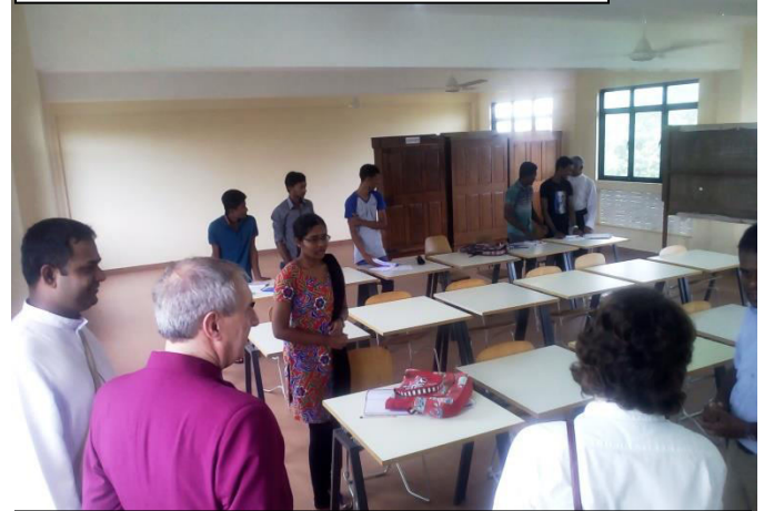
Meeting the students who are being trained for the NVQ exams