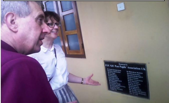
Ready to have a look at the Viewing Gallery