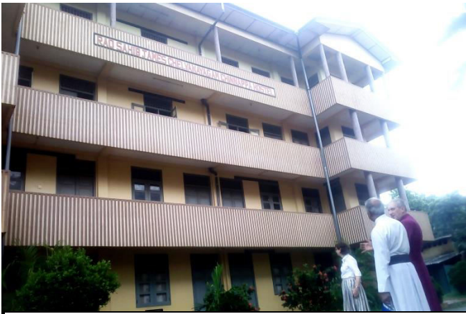
Outside the towering new addition to St. John's