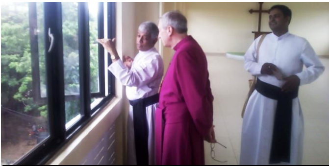
Inside and outside the First Four-Storeyed Technology Block in the Island (at School Level)